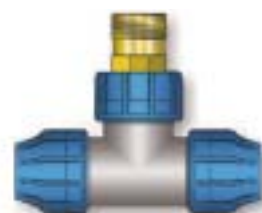
T 90° s mosadzným konektorom 64910